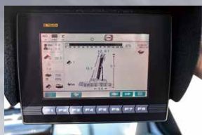
7"HD E-touch, optimized display of every working condition